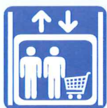
Passenger and freight transport